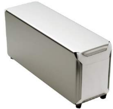
TABLE TOP LOWFOLD

Fully Stainless Steel table top Napkin Dispenser best situated in a commercial self service area. Holds 250 napkins.