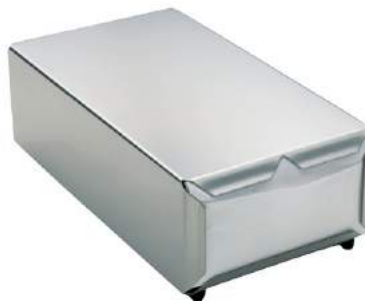
TABLE TOP MINIFOLD

Fully Stainless Steel table top Napkin Dispenser best situated in a commercial self service area. Holds 250 napkins.