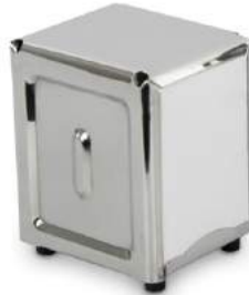
TABLE TOP LOWFOLD

Lowfold table top napkin dispenser in stainless steel, compact enough to sit on each table, leaving enough room to be comfortable.