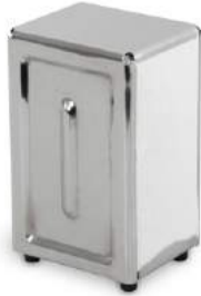
TABLE TOP TALLFOLD

Tallfold table top napkin dispenser in stainless steel, compact enough to sit on each table, leaving enough room to be comfortable.