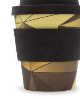
Swanston & Collins