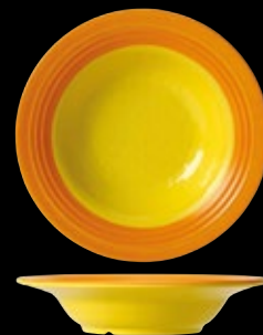
Bowl EL669 20.3cm (8") NEW