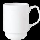
Beaker Stacking 0403 26.0cl (9oz)