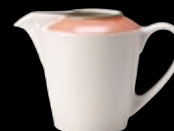
Jug Harmony 0838 14.25cl (5oz)