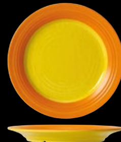
Plate EL668 23.0cm (9") NEW