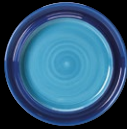
Plate 0122 25.5cm (10") NEW