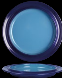
Freedom Plate EL677 25.0cm (10") NEW