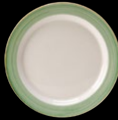
Plate Slimline 0209 27.0cm (10 5 / 8 "") 0210 25.5cm (10") 0211 23.0cm (9") 0212 20.25cm (8") 0213 17.75cm (7") 0214 15.75cm (6 1 / 4 "")