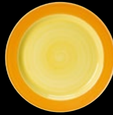
Plate Slimline 0211 23.0cm (9") NEW