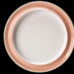
Plate 0122 25.5cm (10")