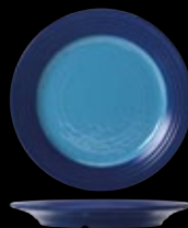
Plate EL667 16.5cm (6½") NEW