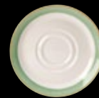
Saucer Double Well 0158 Large 14.5cm (5 3 / 4 "")