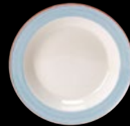
Soup Plate 0215 21.5cm (8 1 / 2 "")