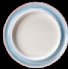
Plate 0123 21.6cm (8 1 / 2 "")