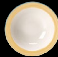
Oatmeal Bowl 0126 16.5cm (6 1 / 2 "")